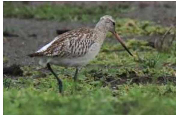
Bar-tailed Godwit Limosa lapponica. Villalba de los Barros reservoir (Villalba de los Barros, Badajoz).