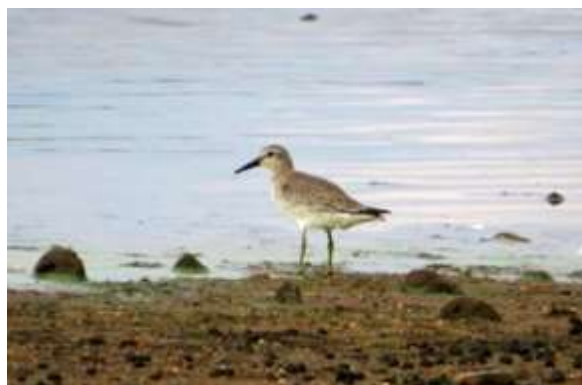
Red Knot Calidris canutus . Portaje reservoir (Torrejoncillo, Cáceres).