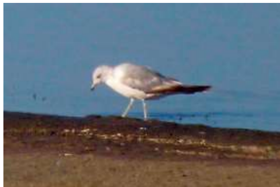
Common Gull Larus canus . Valdecañas res. (El Gordo, Cáceres).

From 2021, Larus canus will be removed from the list of rarities in Extremadura.