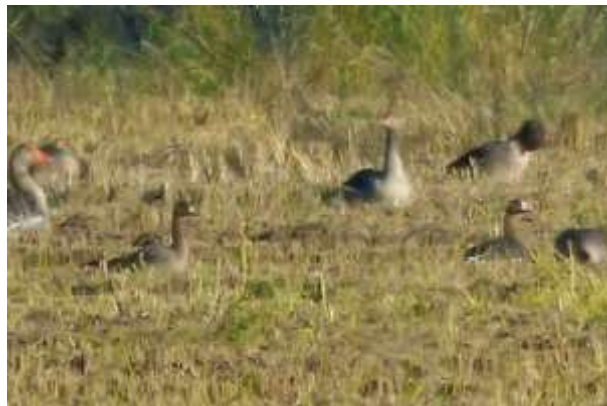
Greater White-fronted Goose Anser albifrons . Logrosán rice fields, (Logrosán, Cáceres).