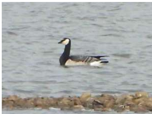
Barnacle Goose Branta leucopsis. Canchales reservoir, (Mérida, Badajoz).