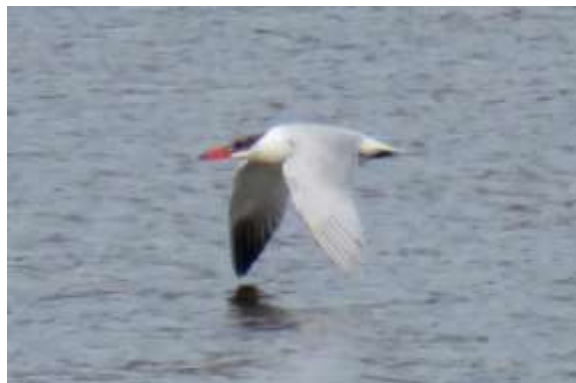
Caspian Tern Hydroprogne caspia . Alqueva reservoir (Olivenza, Badajoz).