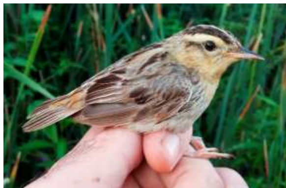
Aquatic Warbler Acrocephalus paludicola . Montehermoso rice fields (Montehermoso, Cáceres).