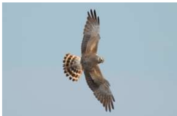
Pallid Harrier Circus macrourus . Cáceres plains (Cáceres).