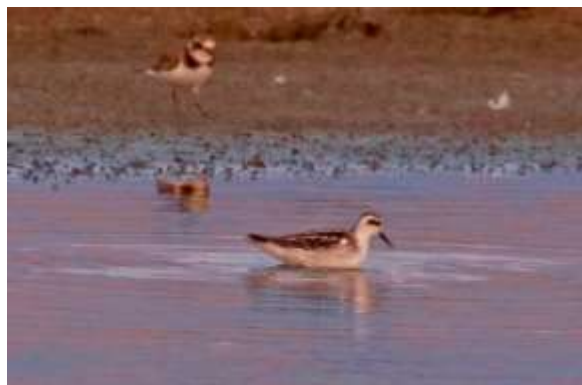
Red-necked Phalarope Phalaropus lobatus . Marinejo reservoir (Trujillo, Cáceres).