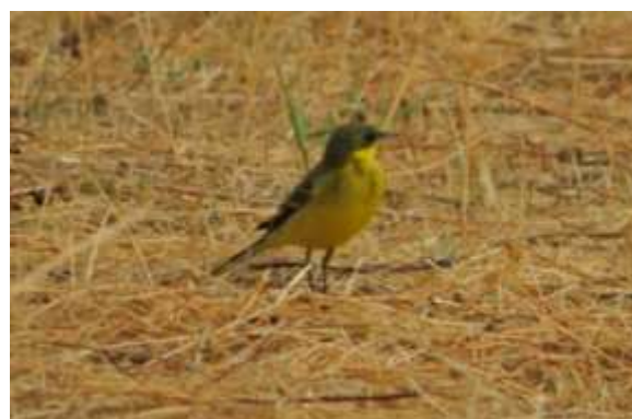
Western Yellow Wagtail ssp. thunbergi Motacilla flava thunbergi . Portaje reservoir (Torrejoncillo, Cáceres).