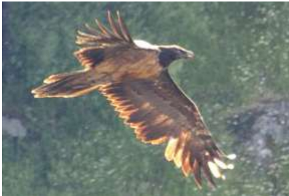
Bearded Vulture Gypaetus barbatus . Monfragüe National Park (Torrejón el Rubio, Cáceres).