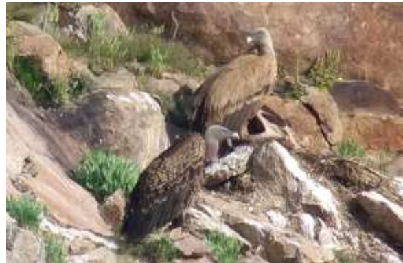
Rüppell's Vulture Gyps rueppelli. Alcántara quarry (Alcántara, Cáceres).