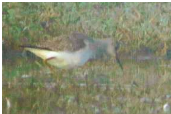
Lesser Yellowlegs Tringa flavipes . Galisteo lake (Galisteo, Cáceres).