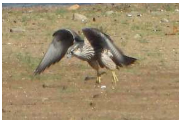
Peregrine Falcon ssp. calidus Falco peregrinus calidus . Canchales reservoir (Mérida, Badajoz).