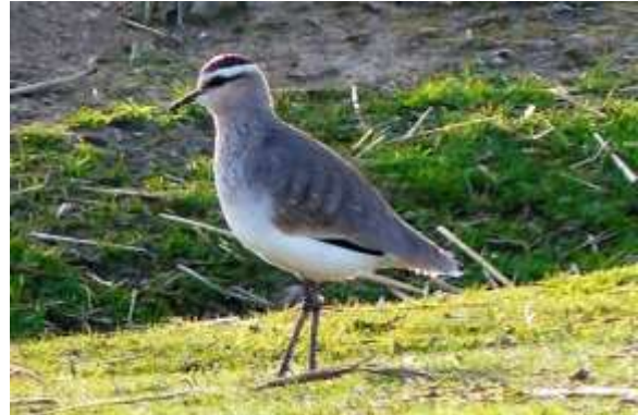
Sociable Lapwing Vanellus gregarius . La Serena (Cabeza del Buey, Badajoz).

accepted by CR-SEO (Rodríguez-Esteban et al. , 2020b).