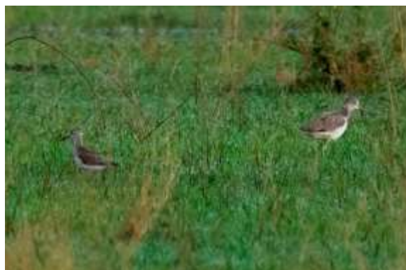
Marsh Sandpiper Tringa stagnatilis . Galisteo pool (Galisteo, Cáceres).