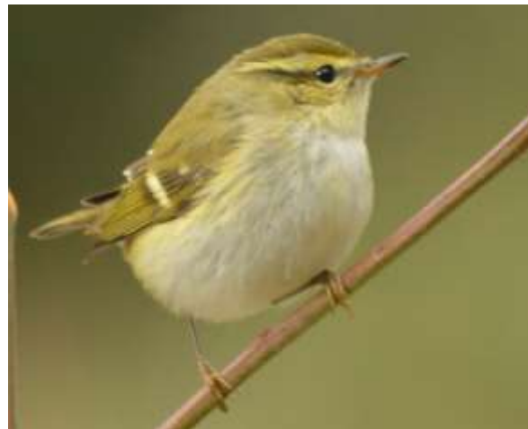
Yellow-browed Warbler Phylloscopus inornatus Serradilla (Cáceres).