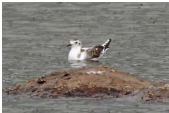
Little Gull Hydrocoloeus minutus . Laguna del Estanco (Oliva de Plasencia, Cáceres).