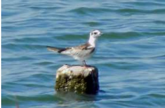
White-winged Tern Chlidonias leucopterus . Arrocampo reservoir (Saucedilla, Cáceres).