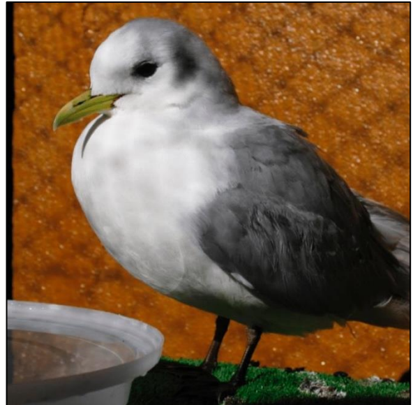
Larus melanocephalus (13/18) Mediterranean Gull

2009. BADAJOZ. Locality not specified. 2nd brought in to AMUS recuperation centre in Feb (AMUS (photo)). Second (and the first accepted) record for Extremadura.