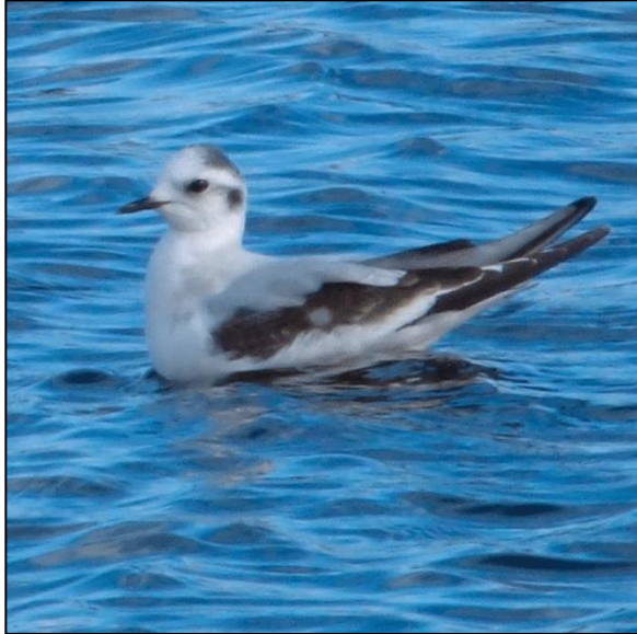
Xema sabini (1/1) Sabine's Gull

2007. BADAJOZ. Montijo weir, Mérida. 1 ad 18th Jun. First record for Extremadura.